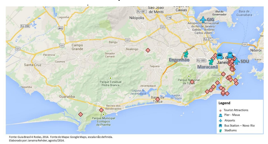
Figure 2. Urban tourism context of the transformations – tourist attractions and transportation hubs